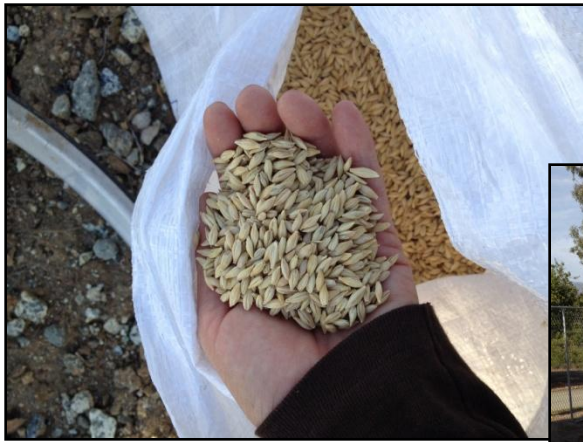
Barley UC 937 Variety- $.37/lb. Seeding Rate- 100-150/lbs per acre