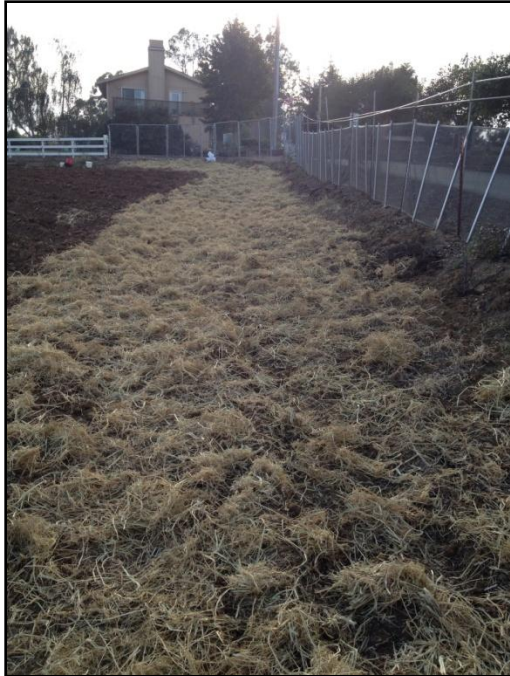
Rice Straw- $7-10/bale Seeding Rate- 40 bales/acre